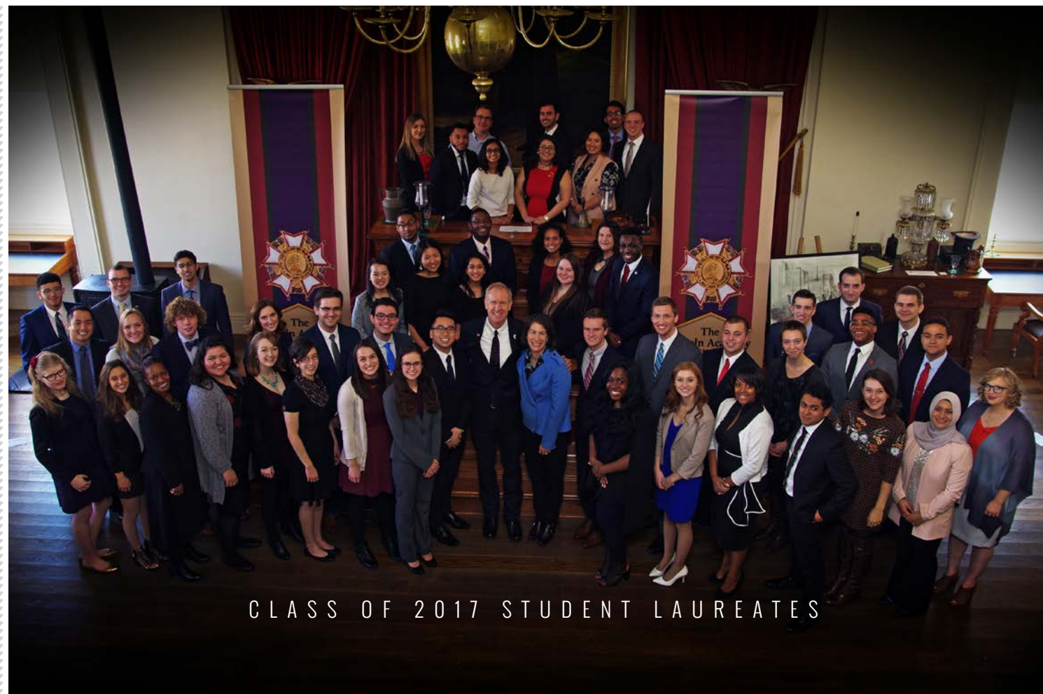
CLASS OF 2017 STUDENT LAUREATES

A forum for emerging leaders to explore the leadership attributes of Lincoln in the context of contemporary issues.