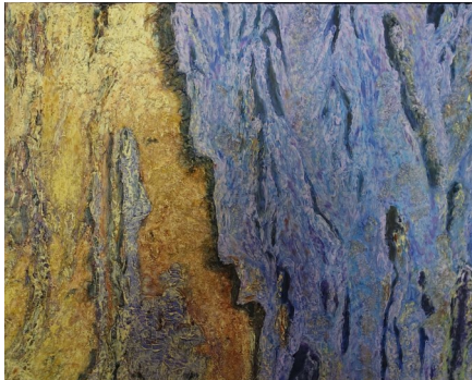
Tree Bark 6